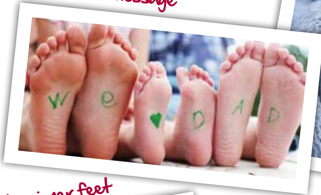
Feet with a message